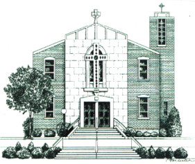
Saint Patrick Church Chatham, New Jersey