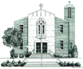
Saint Patrick Church Chatham, New Jersey